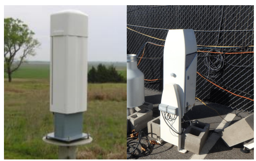
Figure 2: The SUNY Stony Brook Ceilometers: Vaisala CL51 (left) and Vaisala CT25K (right)

The CL51 and CT25K both use a single lens which allows for more accurate measurement at lower altitudes. They are automatic and have self-diagnostic capabilities, allowing them to operate unaided for long periods of time. The CL51 has an altitude range of 15 km while the CT25K has an altitude range of 7.5 km. The CT25K is attached to a pedestal base and can be manually tilted to different tilt angles ranging from -15° to 90° from the vertical. The CL51 also has a tilting feature. These ceilometers can detect up to three cloud layers simultaneously as well as vertical visibility. Additional instrument specifications are listed in Table 1 below.