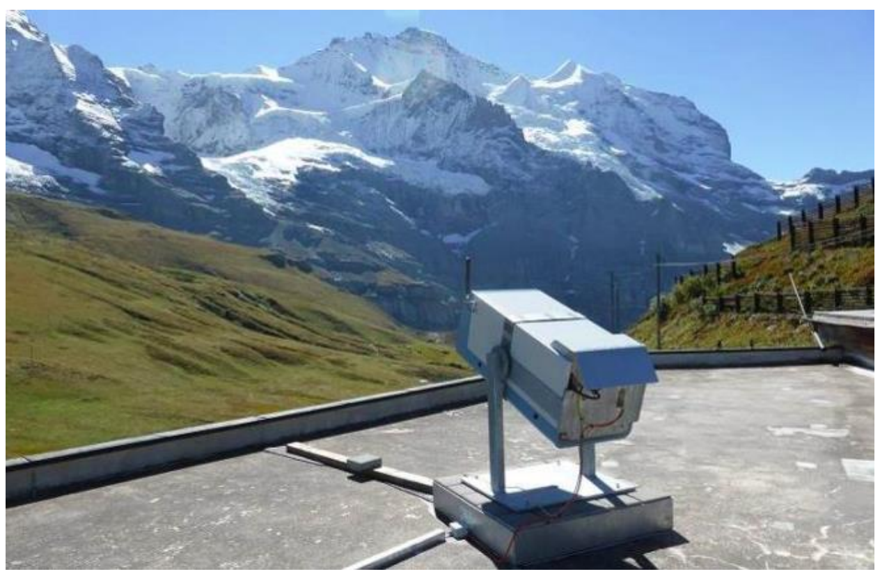
Figure 3: Lufft Ceilometer CGM 15K

Additional information for each ceilometer is available below: