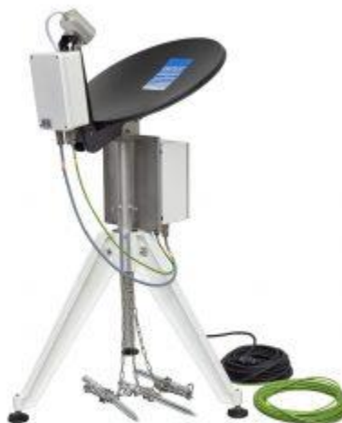
Figure 3: Image of the MRR-PRO instruments