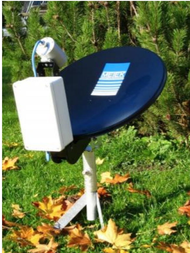
Figure 2: Image of the MRR-2 instrument

The MRR-PRO combines the unique MRR technique of the MRR-2 and a high performance processing unit which significantly improves all operating parameters. The system allows precise measurements of the Doppler spectra caused by hydrometeors and yields the rain