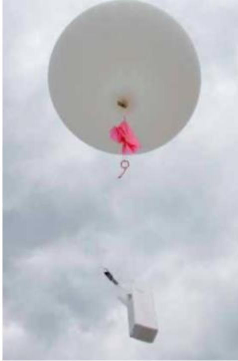
Figure 2: Radiosonde on a weather balloon