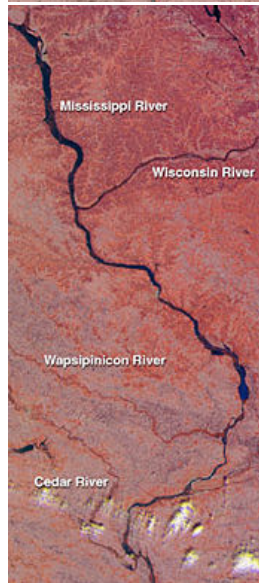
In the spring of 2001, flooding of the Mississippi River produced near-record water levels in Minnesota, Wisconsin, Iowa, and Illinois. These MISR images compare the river on March 26, 2001 (top) and April