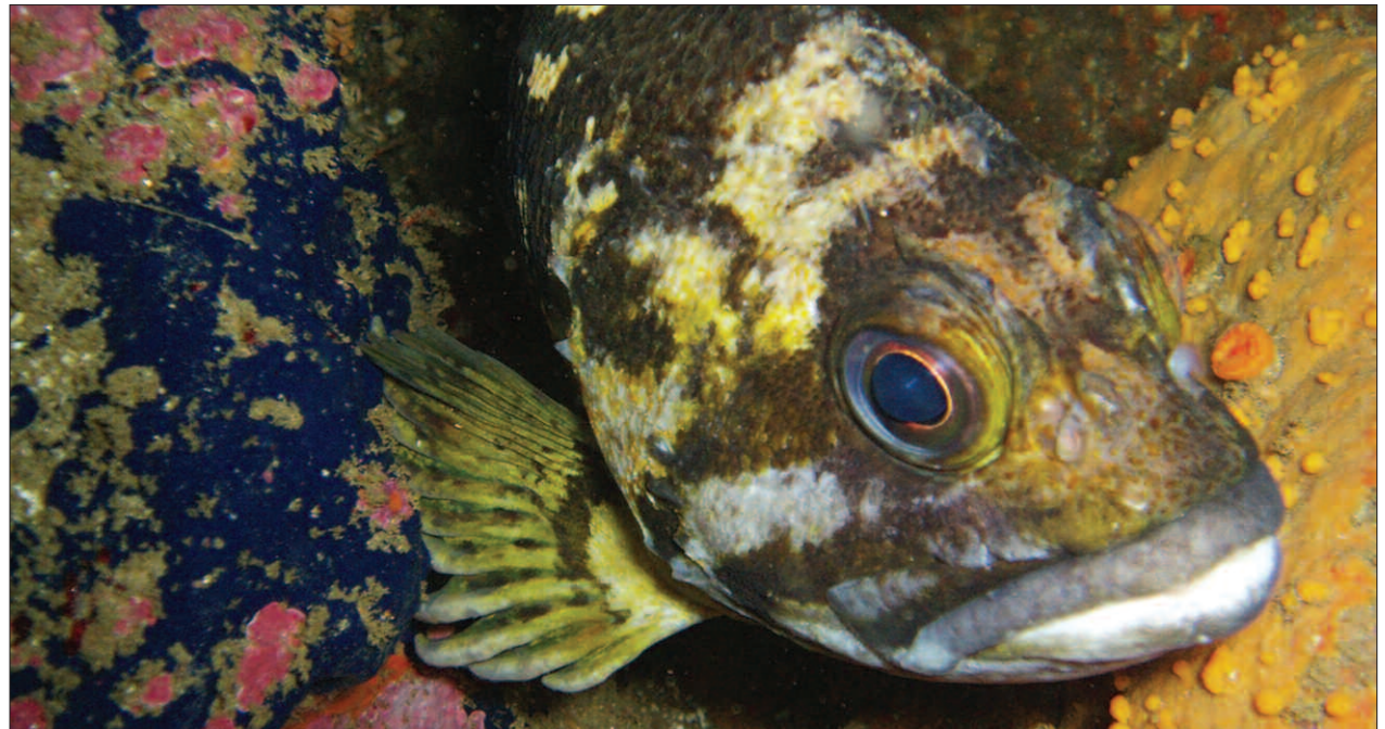
The ocean food web is filled with little-known varieties of fish and marine animals; here, a black and yellow rockfish swims in Monterey Bay, California.