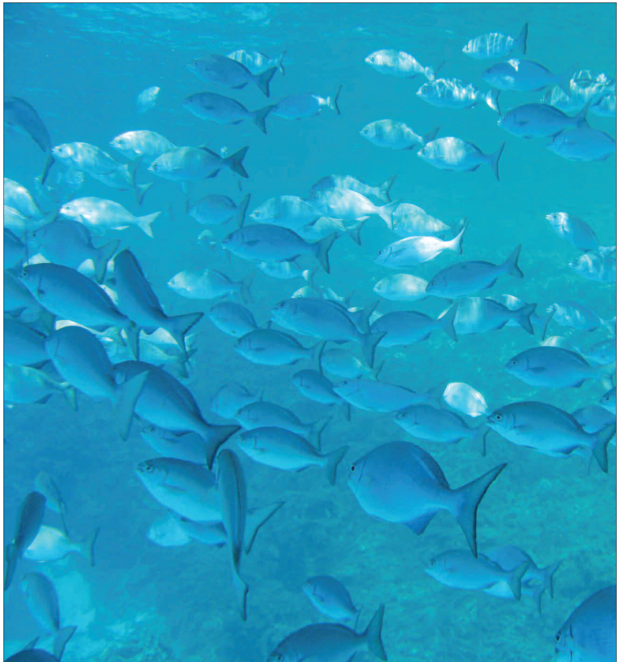
Beneath the ocean’s surface, its food webs depend on creatures small and large, such as this school of chub at the Kure Atoll State Wildlife Refuge in the Papahānaumokuākea National Monument.