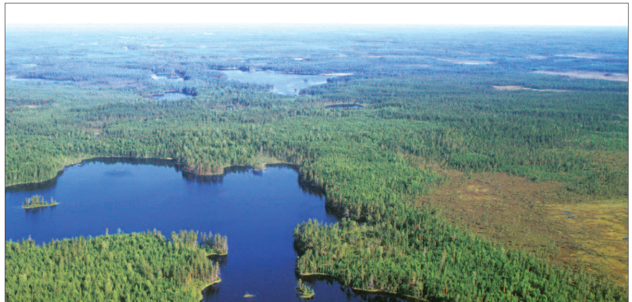
This aerial photograph shows a small section of the sprawling boreal forests in the Karelia Republic, Russia. Much of this mosaic of forests, lakes, rivers, and wetlands, dominated by spruce trees, is virgin forest. However, the region is rapidly changing because of logging.