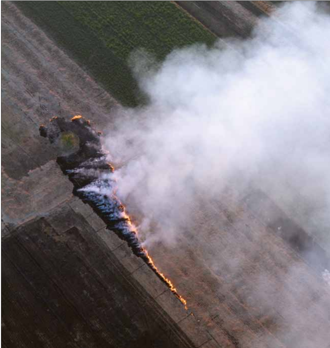
This aerial photograph shows an agricultural field burning in the Nile Valley. Burning helps prepare fields for the next crop, but some kinds of agricultural burning have been prohibited to help curb air pollution in the Cairo area.

learn where the smoke plumes originated, and where they traveled. As it turned out, the plumes blew directly towards Cairo.