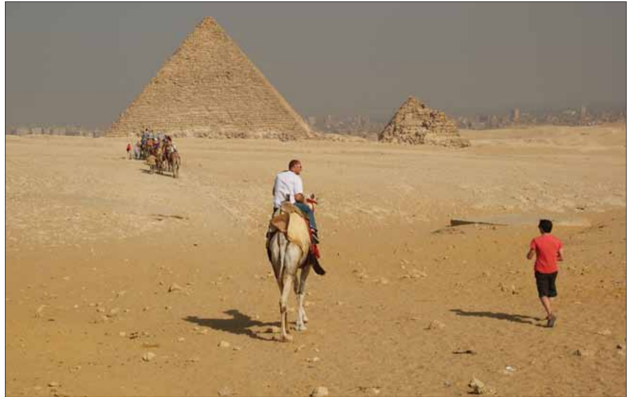
The city of Cairo is barely visible behind the pyramids in this photograph, due to the heavy layer of haze.