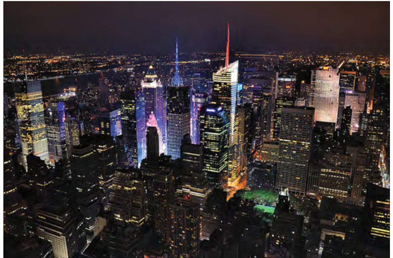
New York City shines brighter than any other U.S. city at night. Nighttime lights can indicate relative economic prosperity.

It is no coincidence that New York City is also one of the top economic centers in the world. Economists first connected economic activity with night lights when the U.S. Department of Defense released satellite images of worldwide lights in the 1970s. Adam Storeygard, an economist at Tufts University, said, “When the satellite lights data were declassified in the 1970s, researchers published papers showing pictures