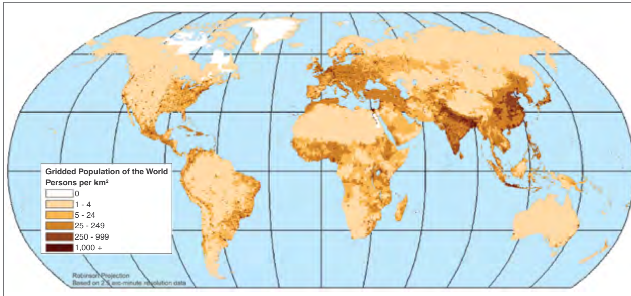
This map shows the Gridded Population of the World data set from the Socioeconomic Data and Applications Center (SEDAC). SEDAC population data are organized using a geographical grid, which makes them easier to link with satellite data.

not as accurate as standard GDP data. “We don’t think that lights data give us a better estimate than what we currently have, but we think that it gives us a different estimate,” Weil said.