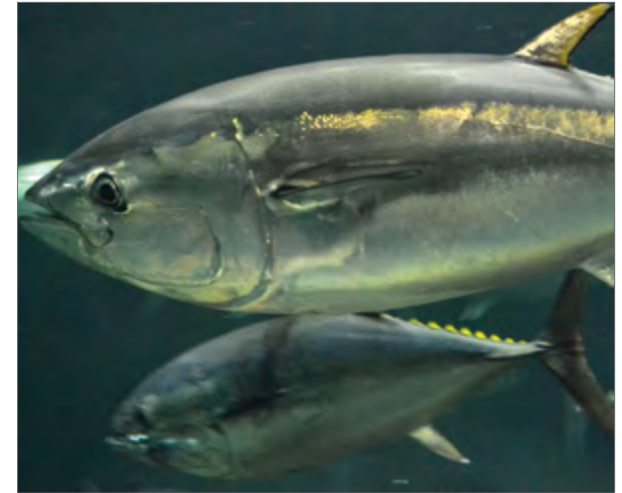
Pacific bluefin tuna are prodigious swimmers, able to cross the Pacific Ocean in less than a month. Advanced fish-finding gadgets allow fishermen to track their now-sparsely populated.