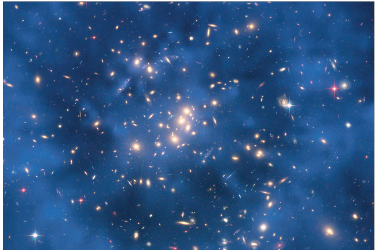
The dark ring in this image from the Hubble Space Telescope shows gravitational lensing, evidence of dark matter.

They are looking for the rest of the universe’s matter. Scientists have calculated that some 25 percent of the matter in the universe is not accounted for. They know something is out there because it is exerting gravitational pull on things that we can see. As light from distant stars passes through a galaxy, for example, the gravitational pull of the galaxy bends the light, as if it were passing through a lens. But when scientists