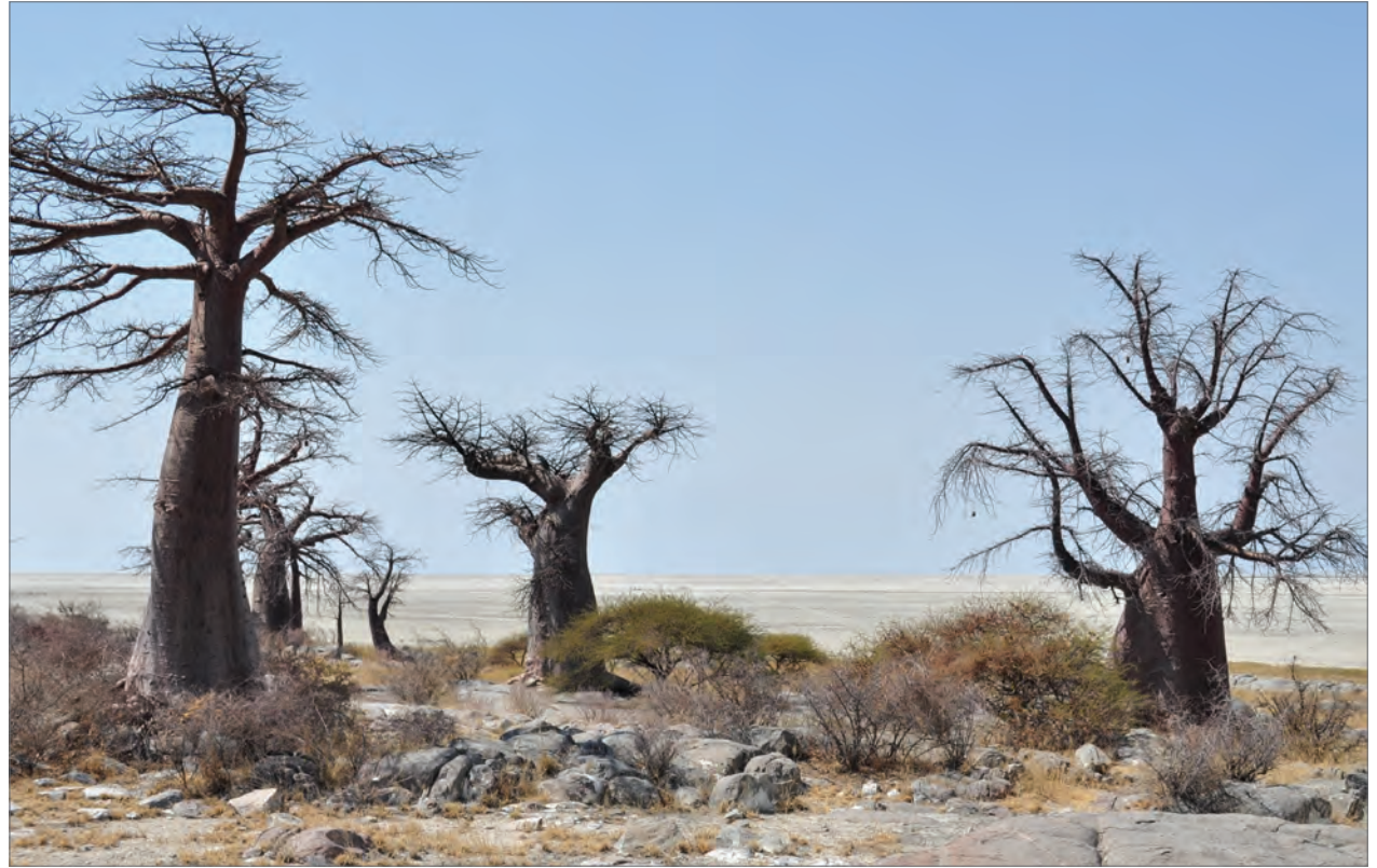
Baobab trees are scattered on Kubu Island, a dry granite rock island located in the Makgadikgadi Pan. Baobabs store water in the trunk to endure harsh drought conditions.

Anecdotal stories told of migration prior to the fence, but in the wild zebras do not live past their teens, and since the fence had been up from 1968 to 2004, there is no way they could have learned the route. "It's not that they followed their mothers as baby zebras and saw the saltpan," Bohrer