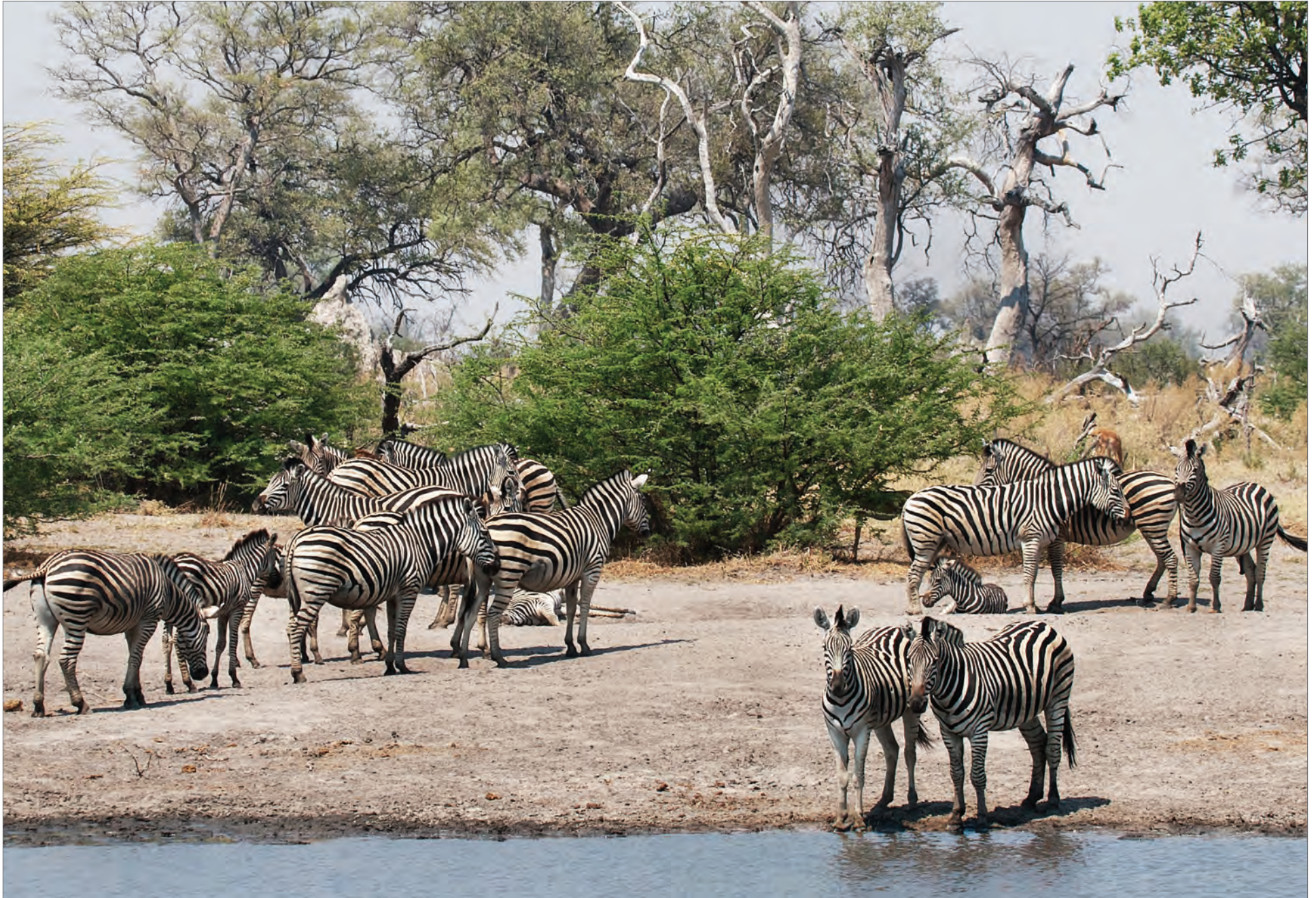
Botswana is home to the second largest zebra migration, following the Serengeti. About 25,000 zebra journey the 190 miles between the Okavango Delta and the Makgadikgadi Pan. Zebra perform an important ecological function as grazers, eating the longer strands of grass that then expose shorter growth, allowing wildebeest easier access to their source of food.