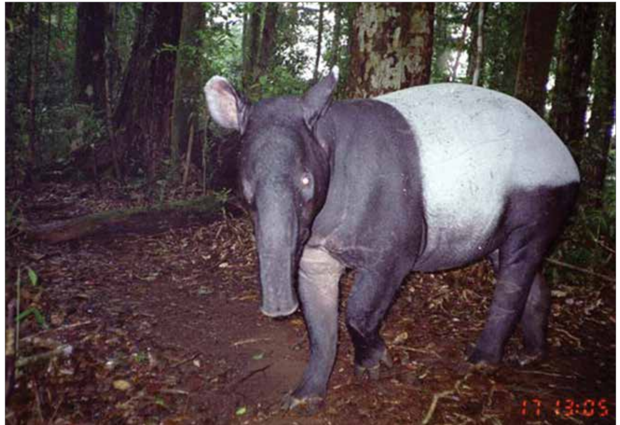
Malayan tapirs are primarily nocturnal, so camera traps usually catch them at night. Their unique black-and-white coloring helps camouflage them in darkness.

rainforest and the sun’s coming up and all these brilliant greens are coming through the forest. Then there’s this big black and white blob the size of a small car crossing the river. Absolutely incredible.” Linkie’s daylight sighting was rare: Malayan tapirs are reclusive, nocturnal creatures that prefer traversing the thick rainforest under-story in darkness.