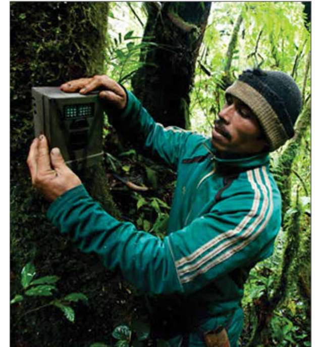
Researchers relied on 1,128 camera traps like these to gather photos of animals in the forests. Although most of the traps were set to catch tigers, they also caught tapirs and other animals that used the same trails.

To map human activity, Linkie used the Human Footprint Index. Linkie had never used the index before, but it is well known within conservation circles, he said. Archived at the NASA Socio-