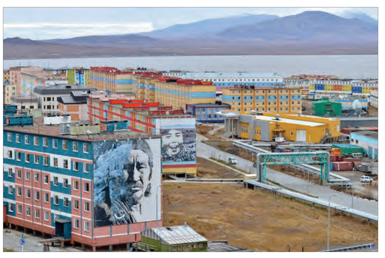
These buildings in Anadyr, Russia, are built on foundation piles to prevent heat from thawing the frozen ground below.

When oil was discovered in northern West Siberia, Russia wasted no time developing the new oil fields. The small fishing settlement of