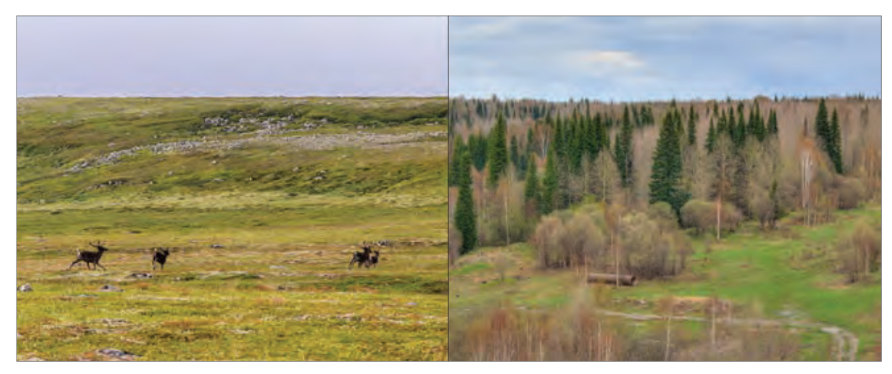
Reindeer scamper across the treeless Arctic tundra, left. Swampy forests, or taiga, are common across sub-Arctic Russia, right.

Overlying many permafrost areas is a thin active layer that thaws seasonally, allowing plants and trees to grow. Larch trees thrive in permafrost regions because their root systems are broad instead of deep, thus remaining in the active