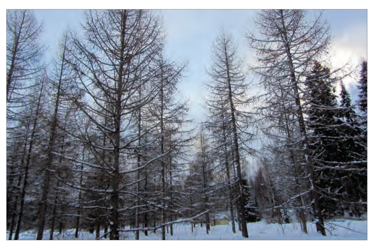
Siberian larch are deciduous conifers, dropping their needles each winter. Larch forests are spreading further north into the Siberian tundra.

"But sand has a different thermal property than the normal soil found in this area," Esau said. Unlike permafrost, which is impermeable, sand allows water to drain through. Sandy surfaces are drier and warmer than the frozen ground beneath, and contribute to the urban heat island effect. "This effect is larger than the city itself, because sandy and artificial surfaces destroy