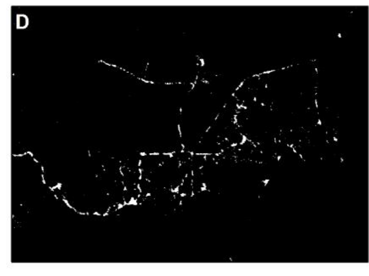
Images of a logged area from a January 2019 PlanetScope image of the Subim forest reserve in Ghana. A) True color image, B) False color-infrared image, C) Normalized difference red-green index (NDRGI), with lighter tones indicating higher values, D) thresholded NDGRI index, with white areas indicating logging disturbance.