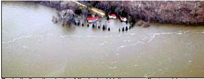
Periodic flooding in the Mississippi Valley can affect residents as far north as Minnesota and as far south as Louisiana. In May 2001, the Mississippi River flooded this house south of Red Wing, Minnesota.

To determine what rivers looked like prior to a flood event, Brakenridge's team used MODIS data to develop a baseline map for many of the world's major rivers. Based on the reflective characteristics of each pixel in an image, the researchers can distinguish water from other land cover types. "It's important to have a standard reference so that when we map a flood, we don't mistakenly include areas that are normally under water, such as lakes, reservoirs, or wetlands," he said.