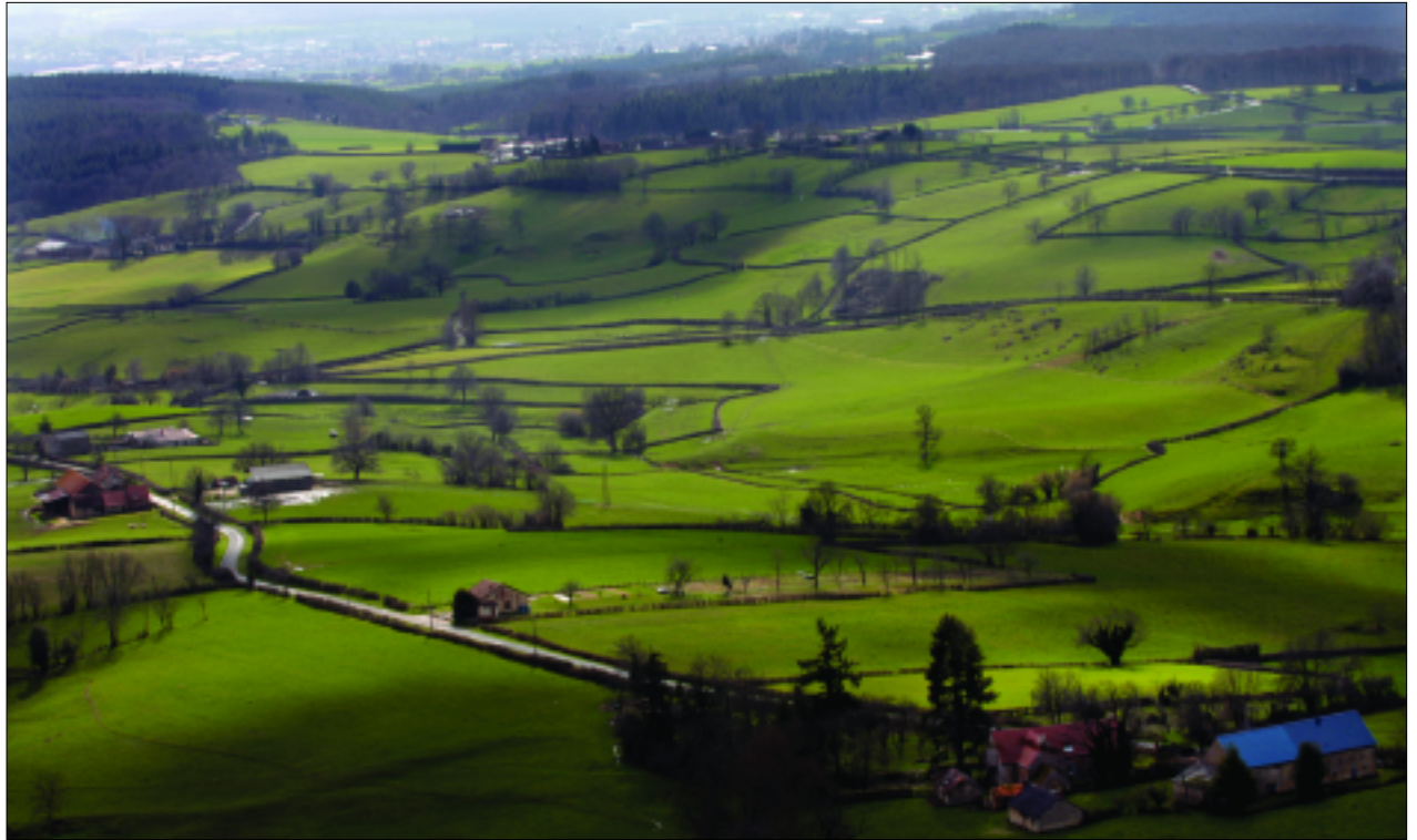
Roman roads, now pressed into modern service, wind through the Burgundy landscape. A succession of cultures have inhabited the study region for centuries.

The question of diversity and adaptability also has interesting implications for today’s society. Aided by remote sensing data, anthropologists have noted that Burgundy forests are increasingly made up of a single species of conifer.