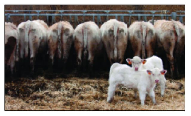
Human beings rely on our planet's net primary production for survival. Plants provide food and fiber, as well as support the animals we use for food and clothing.

To measure net primary production, Imhoff used Normalized Difference Vegetation Index (NDVI) data, which quantify the presence of healthy vegetation. The data, originally from the Advanced Very High Resolution Radiometer (AVHRR) instrument, were reprocessed under the International Satellite Land-Surface Climatology Project to retrieve NDVI. The data were taken every sixteen days from 1982 to 1998, allowing Imhoff to compute an average maximum NDVI for each month of the year. The monthly NDVI data were input to a biophysical model together