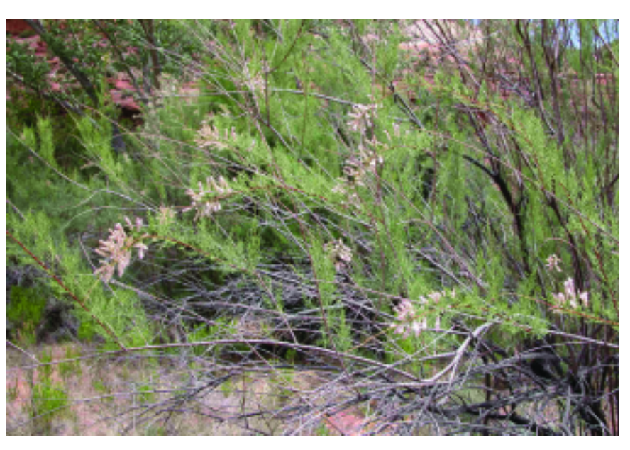
Invasive tamarisk trees like this one continue to gain footholds in the West, changing habitats and pushing out native species. Without intervention, they could be cropping up soon in surprising places, such as the Midwest.

Instead of trying to eliminate large, established stands of an invader, resource managers find it more effective to focus on containment. Paintner said, "The Park Service is focusing more on the edge of a species range. The problem isn't knowing where it is. It's knowing where it isn't." Identifying potential habitat for tamarisk, then watching those areas to prevent tamarisk from becoming established, has become an effective strategy. Yet watching over immense and remote tracts, resource managers cannot continually inspect every riparian area for tamarisk. The maps that Morisette and team