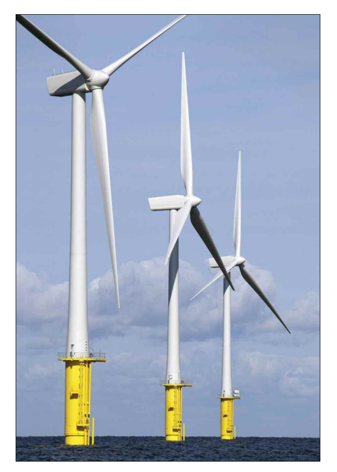
Offshore wind turbines take advantage of predictable winds to produce carbon-free energy; potential sites are often close to electricity-hungry population centers.

energy but without strong storms that pose a threat to the installation." Second, offshore turbine foundations must be on relatively shallow coastal shelves; the deepest installed turbine is currently rated for 50 meters (164 feet) in depth. Finally, the site must be able to accommodate the whirling blades of enough turbines to be