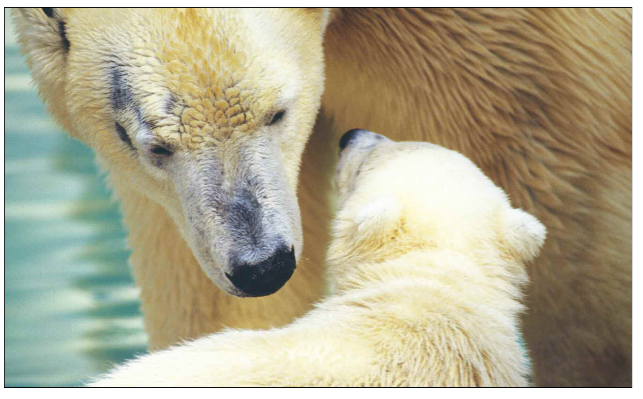
Arctic sea ice provides critical habitat for polar bears. Researchers are increasingly concerned that negative trends in summer sea ice extent may affect polar bear reproduction and species survival.

The 2005 record low spurred the United States Department of the Interior to ask for scientific projections of polar bear survival and population trends into the 21<sup>st</sup> century. The news was not good: if sea ice declines at the rate that scientific models predict, only one-third of the world's polar bears will survive by the end of the 21<sup>st</sup> century.