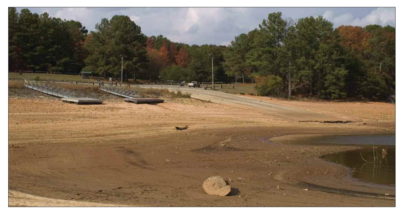
Boat ramps and docks at Lake Lanier, Georgia, were exposed during a severe drought that siphoned water levels to record lows. This photograph was taken in November 2007 from a point normally about 150 yards from the shore.