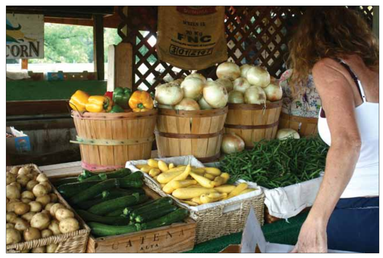
Growing water-intensive crops such as these vegetables requires good timing of irrigation in areas with insufficient rainfall. A network of soil moisture sensors could help manage drought and water resources.

The Tashkent data were perfect for her purpose. Larson found it by searching through raw GPS data sets provided online by the NASA Crustal