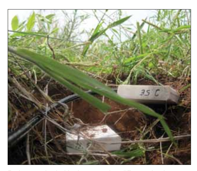
Probes are buried in the ground at different depths to estimate soil moisture content, but they only measure moisture within several inches of the instrument.

tens of kilometers away." Rainfall can vary over an area this size, so the team needed to create an experiment where they could obtain reflected GPS signals and soil moisture measurements from the exact same site. They chose a test area at a shortgrass steppe in Marshall, Colorado. Braun set up a GPS receiver as well as instruments to measure precipitation. To validate the GPS data, Small buried several sets of soil moisture probes at different depths in the soil throughout the field site.