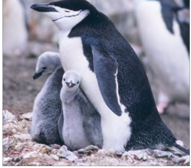
This Adelie penguin (top) is regurgitating krill to feed its chick. Adelie populations have crashed along the northern Antarctic Peninsula, as their food source of krill diminishes. Adelies have been replaced by other species, like Chinstrap penguins (bottom), that do not rely as heavily on krill.

"The krill are disappearing in the north and are actually increasing in the south. The food web is moving south and is being replaced by a different food web to the north."