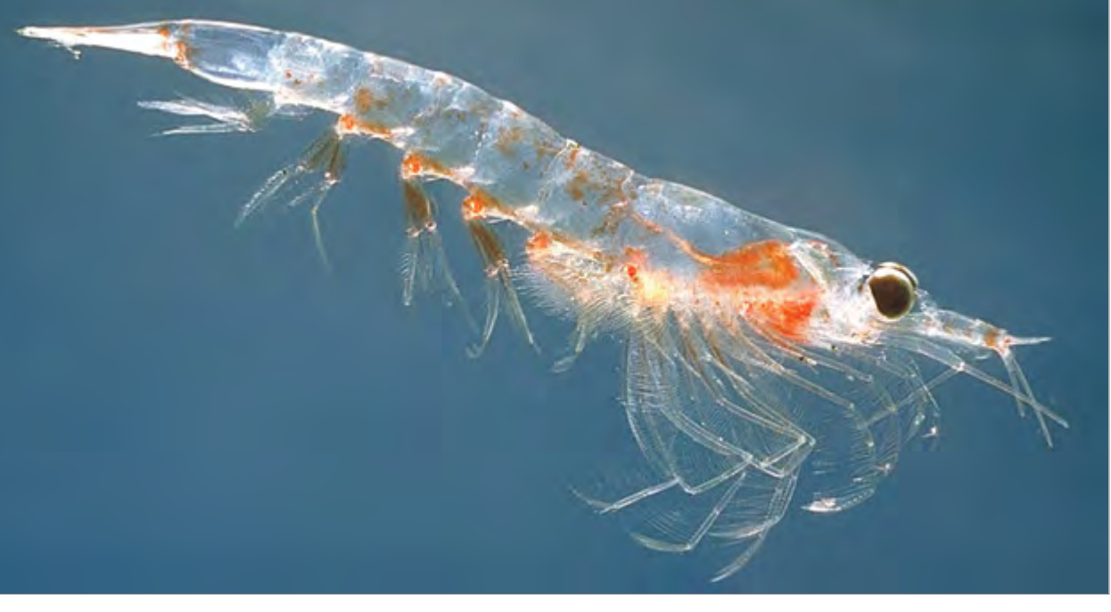
Krill are small, shrimp-like sea creatures that form the basis of an entire marine food chain. Along the northern Antarctic Peninsula, penguins and whales feed on krill. Southern Ocean krill are similar to the northern krill shown in this photograph.