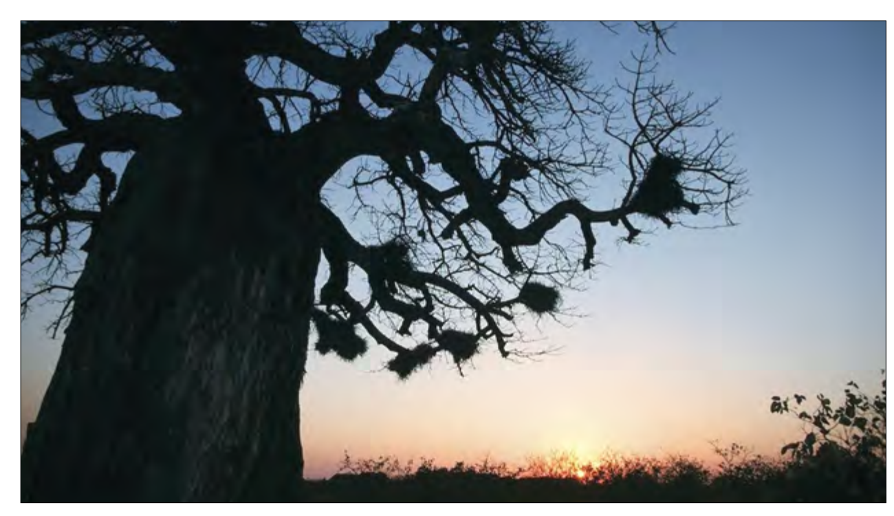
The scraggy branches of a South African baobab tree catch the last rays of sunlight for the day.

The problem is, no satellite instrument has mapped the myriad structural features of the land surface both closely enough and