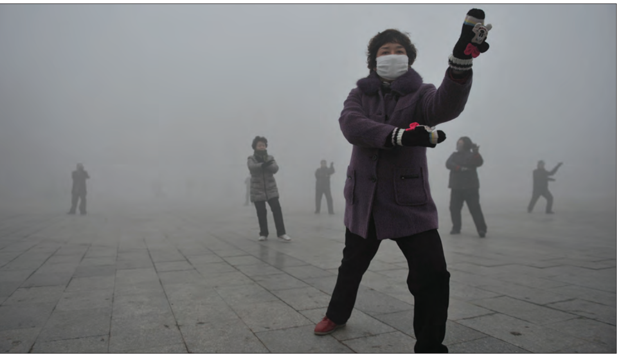
Retirees perform tai chi during a smoggy day in Fuyang, China in January 2013.