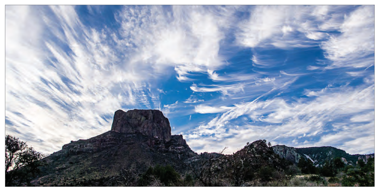
High, wispy cirrus clouds stream over Big Bend National Park in Texas, USA. Many of the cirrus shown here have been pulled by the wind in such a way that they resemble horses' tails.

Most cirrus stream out of the chimneys of tropical cyclones or form at the top of boiling thunderstorms, and can stretch over entire