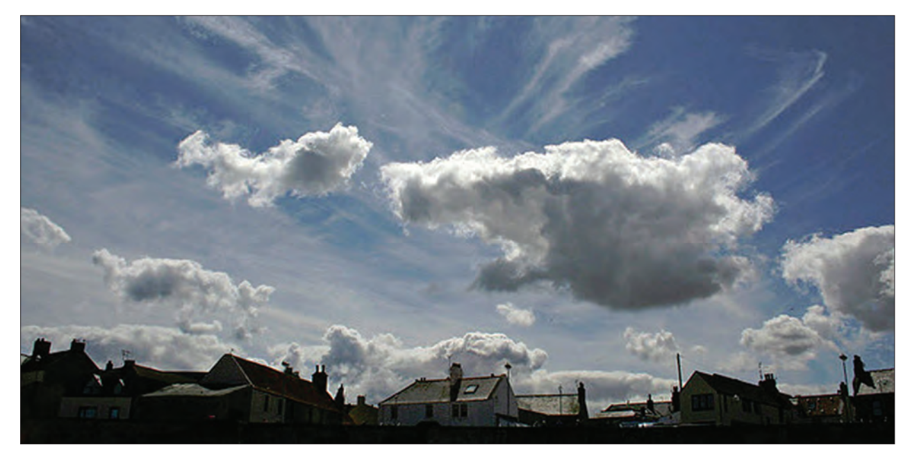
High, cold cirrus and lower, puffy cumulus clouds hover above homes in Eyemouth, Scotland.

Put a cloud below the cirrus, however, and the dynamic changes. "What happens now that you have a cloud below the cirrus?" Stephens said. "It reduces the ability of the cirrus to trap heat. So the greenhouse effect of a cirrus cloud depends on what's below it." This complicates the already perplexing task of mapping clouds on a global scale, which is exactly what scientists need to do to calculate the sway clouds hold over the energy