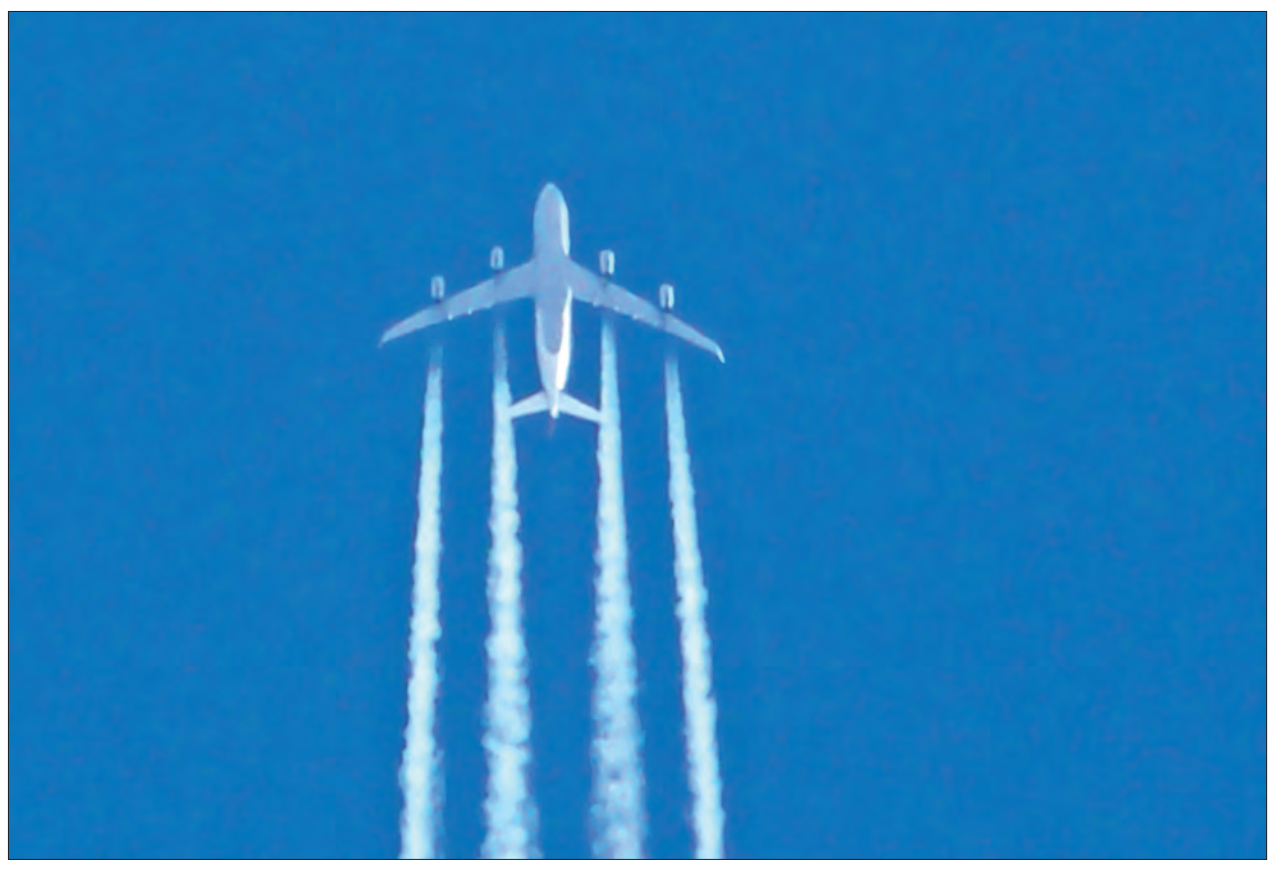
Contrails, or condensation trails, form when water vapor from airline exhaust condenses and freezes, forming clouds made of ice crystals. Scientists study contrails because, like naturally occurring clouds, they may contribute to a warming or cooling effect in Earth's atmosphere.

Whether natural or man-made, clouds can help warm or cool Earth: they reflect incoming sunlight and trap heat in the atmosphere. But until recently, scientists were uncertain how contrails