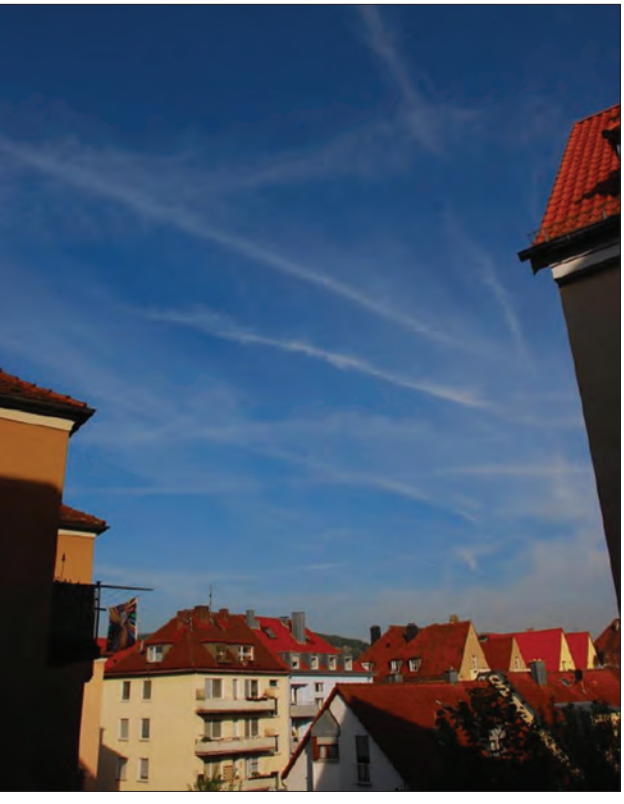
The image on the left shows the sky above Würzburg, Germany, without contrails after air traffic was temporarily grounded in 2010. The image on the right shows the sky with regular air traffic on a day when conditions were right for contrails to form.

serve as a blanket, trapping heat emitted from Earth's surface, inducing a warming effect. The researchers needed to analyze both to understand whether contrails have a warming or cooling effect in Earth's atmosphere, what they call the net radiative effect.