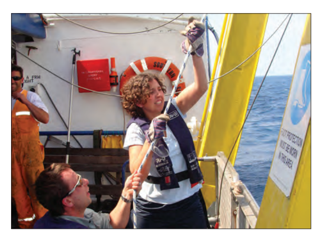
The research team hauls in a fine mesh net to sample live salps during their asexual solitary stage, keeping them for only a few hours to determine their growth and fecundity. These gelatinous, barrel-shaped filter feeders are supremely abundant with an asexual stage that can release 240 buds in a week. They feed on a virtually unlimited carbon resource and thrive in rich phytoplankton areas.

Eddy Avenue helps shed light on the migration of species out of their usual bounds. As key players in heat transportation, eddies provide nutrients for phytoplankton, photosynthesizing microscopic organisms, often green from the chlorophyll pigment present in their cells. Not all eddies do this, however. Two types exist: cyclonic and anticyclonic. The centers of cyclonic eddies dimple the ocean surface. The direction