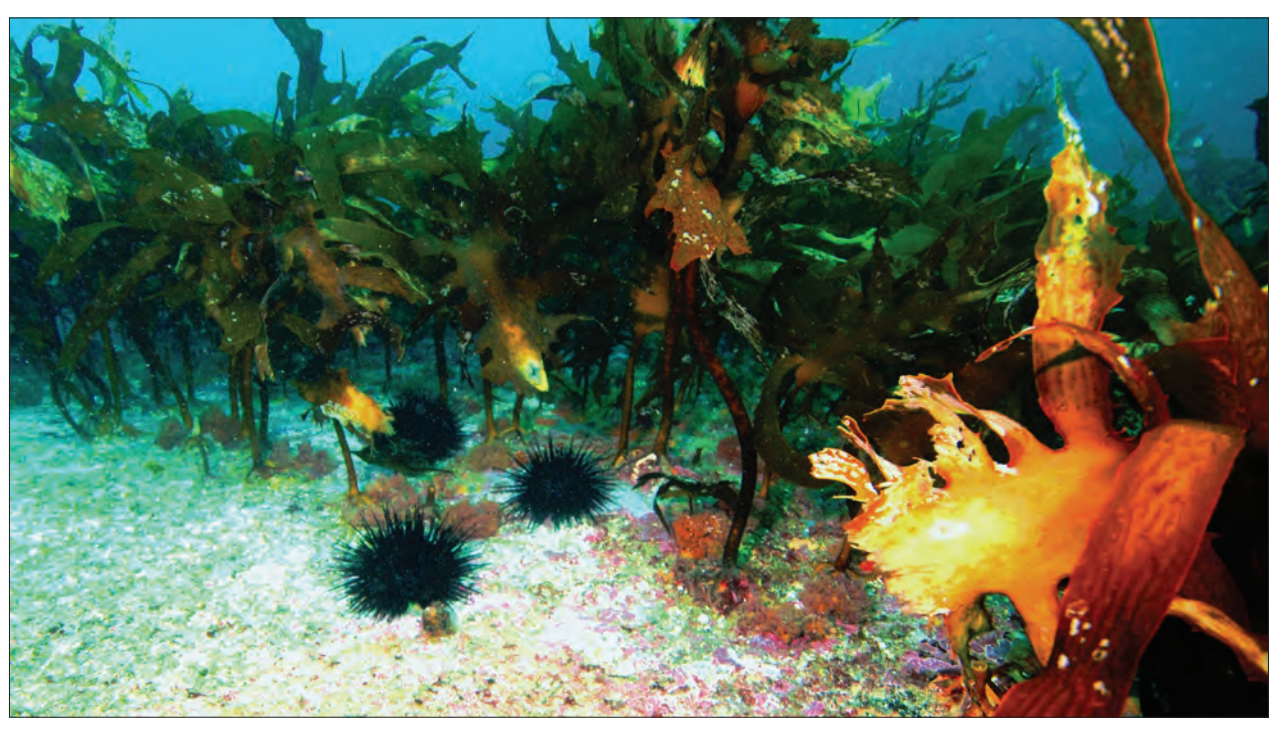
Long-spined sea urchins nest on a depleted kelp bed off the coast of eastern Tasmania. Lush sea kelp forests turn into barren fields of rock once the sea urchins take over.

"The temperatures off the east of Tasmania are some of the fastest rising in the world," said Iain Suthers, a professor at the University of New South Wales (UNSW). Average winter sea temperatures have warmed to 12 degrees Celsius (54 degrees Fahrenheit), the survival threshold for spawning sea urchin, allowing them to reproduce longer. "This isn't unique to the EAC. All poleward boundary currents are strengthening," Suthers said. Boundary currents interact with coastlines, and unlike their eastern counterpart, western boundary currents move poleward within strong, deep, and narrow channels.