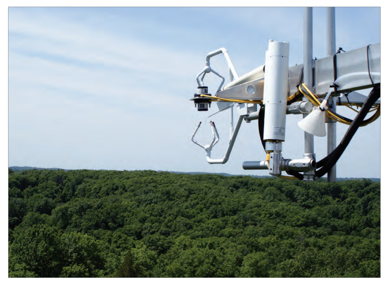
Sensors sniff out the comings and goings of carbon dioxide at the Missouri Ozarks AmeriFlux site.

earth and exhaling carbon dioxide that wafts up into the tree canopy. At sunrise, billions of forest leaves would take what the soil exhaled during nighttime and give something back, sucking in carbon dioxide for the hard work of photosynthesis, and releasing oxygen to complete the exchange.