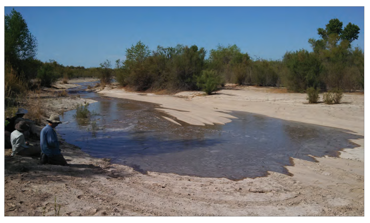
USGS scientists track the timing of the long-awaited return of the Colorado River to its parched delta in Mexico on March 24, 2014.

Yet the Colorado River is just one of many beleaguered rivers in the United States, raising a question: Do we have enough water to meet our needs, now and in the future? Or is the dry Colorado River Delta a scene that will be played out again and again across the country as we continue to overuse our most precious resource? To help find the answers, 145 years after Powell's expedition, the United States Geological Survey