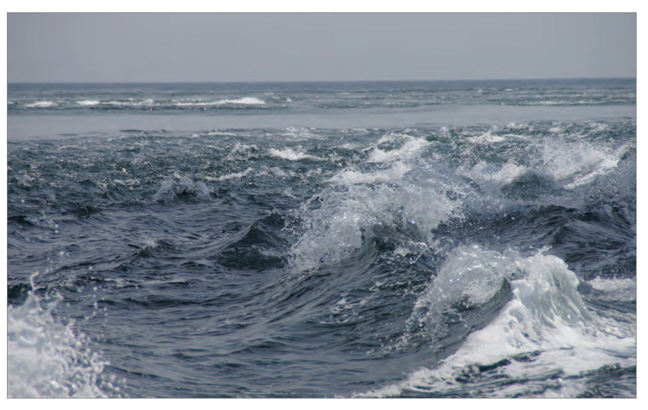
In Naruto, Japan, a boundary between different water masses appears as a sliver of still water beyond turbulent waters. The stratification of disparate densities creates varying momentums within the ocean waters.

Though the science in the film is flawed and the events exaggerated, scientists acknowledge that if enough freshwater dumps into the North Atlantic Ocean, the large-scale Atlantic Meridional Overturning Circulation that transports heat from the tropics to the North Atlantic could slow down and potentially lead to colder climate in Europe. The actual mechanisms behind the