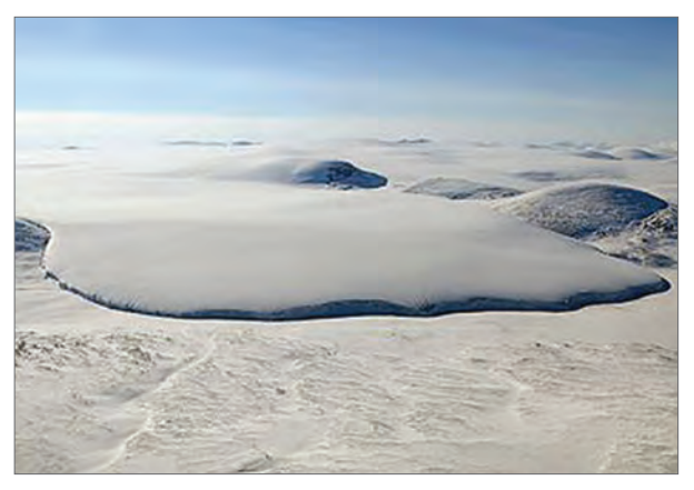
The NASA IceBridge mission continues to survey the Barnes Ice Cap on Baffin Island. This remnant of the Laurentide ice sheet belies its once massive size, when it covered all of Canada and parts of the northern U.S. Sudden shifts in deep ocean currents may have initiated past ice ages.

"Aquarius picked up the signal, so that was a pleasant surprise," Gierach said. But there was something else, the extent. "This wasn't just