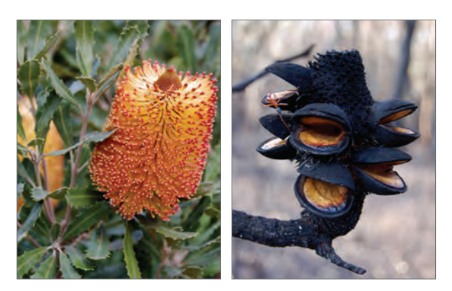
This photograph shows Banksia media before and after a fire.

"We want to understand how productivity in ecosystems influence fire activity on a global