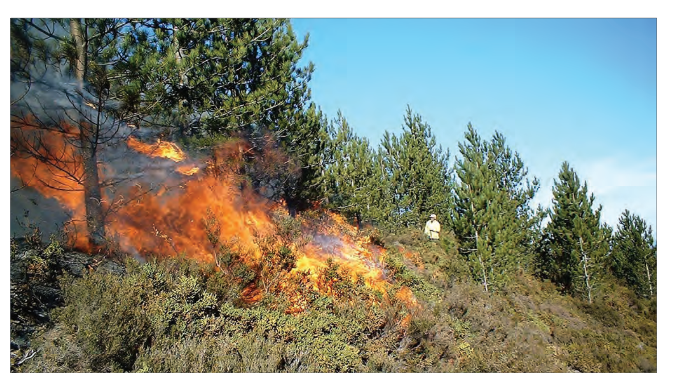
A prescribed fire is applied to a Pinus nigra stand in Portugal.

Scientists are piecing together a global portrait of how fire behaves around the globe, in antici-