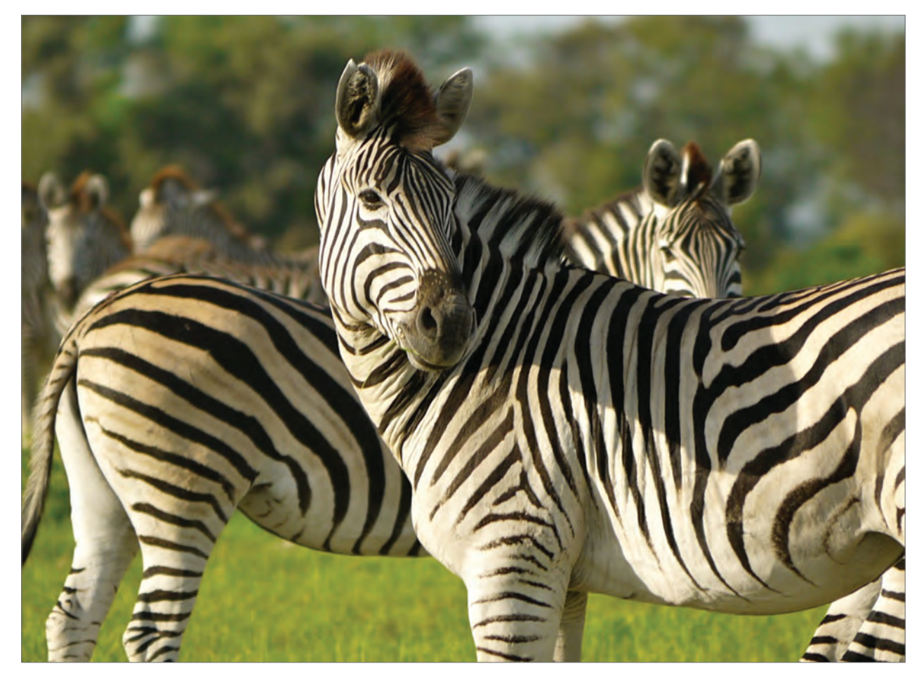
Zebra stripes come in different patterns, unique to each individual. They are social animals that live in harems. Here two stand in the Okavango Delta, Botswana. Unlike horses or donkeys, zebras have never been truly domesticated.

researcher from the University of Bristol in the U.K., stood on top of a jeep, pointing an antenna into the savanna grasslands. She attempted to download Global Positioning System (GPS) data from her collared zebras, tracking their movement within the Okavango Delta. Then the sky