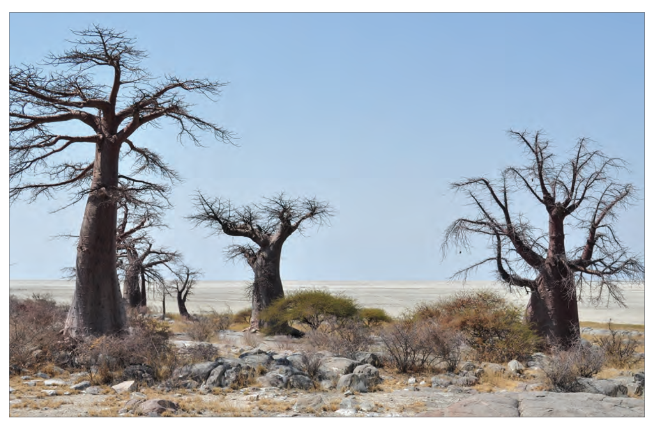
Baobab trees are scattered on Kubu Island, a dry granite rock island located in the Makgadikgadi Pan. Baobabs store water in the trunk to endure harsh drought conditions.

Anecdotal stories told of migration prior to the fence, but in the wild zebras do not live past their teens, and since the fence had been up from 1968 to 2004, there is no way they could have learned the route. "It's not that they followed their mothers as baby zebras and saw the saltpan," Bohrer