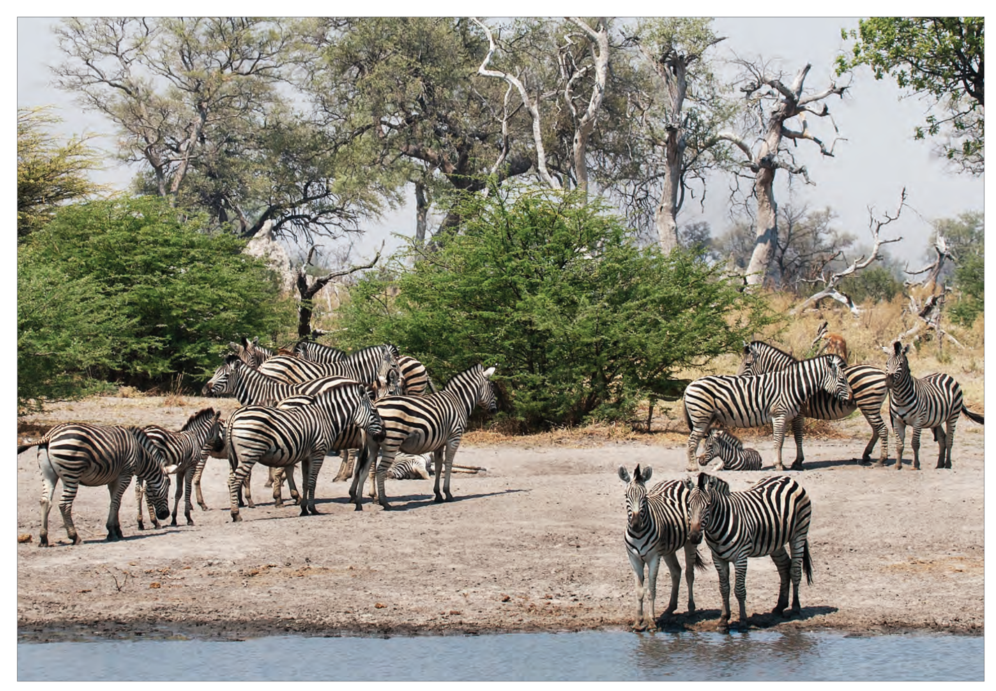
Botswana is home to the second largest zebra migration, following the Serengeti. About 25,000 zebra journey the 190 miles between the Okavango Delta and the Makgadikgadi Pan. Zebra perform an important ecological function as grazers, eating the longer strands of grass that then expose shorter growth, allowing wildebeest easier access to their source of food.