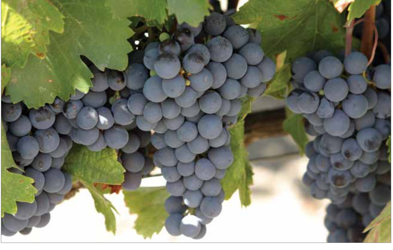
Ripe malbec grapes hang from the vine in Mendoza Province, Argentina.

Though wine buffs might recognize that tagline for Malbec World Day, a celebration of Argentina's flagship wine, scientists have discovered that storms from the region bear the same characteris-