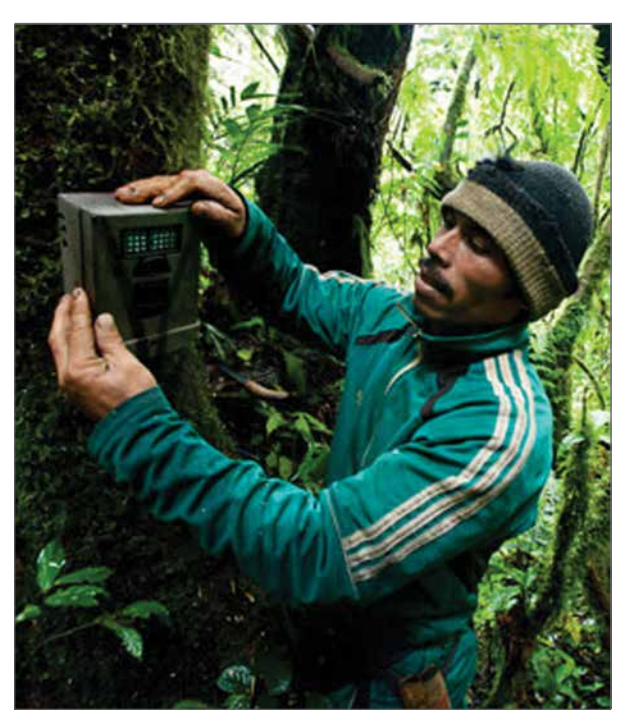
Researchers relied on 1,128 camera traps like these to gather photos of animals in the forests. Although most of the traps were set to catch tigers, they also caught tapirs and other animals that used the same trails.

To map human activity, Linkie used the Human Footprint Index. Linkie had never used the index before, but it is well known within conservation circles, he said. Archived at the NASA Socio-