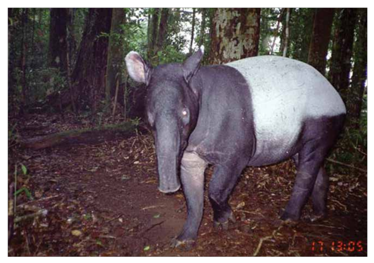
Malayan tapirs are primarily nocturnal, so camera traps usually catch them at night. Their unique black-and-white coloring helps camouflage them in darkness.

rainforest and the sun's coming up and all these brilliant greens are coming through the forest. Then there's this big black and white blob the size of a small car crossing the river. Absolutely incredible." Linkie's daylight sighting was rare: Malayan tapirs are reclusive, nocturnal creatures that prefer traversing the thick rainforest understory in darkness.