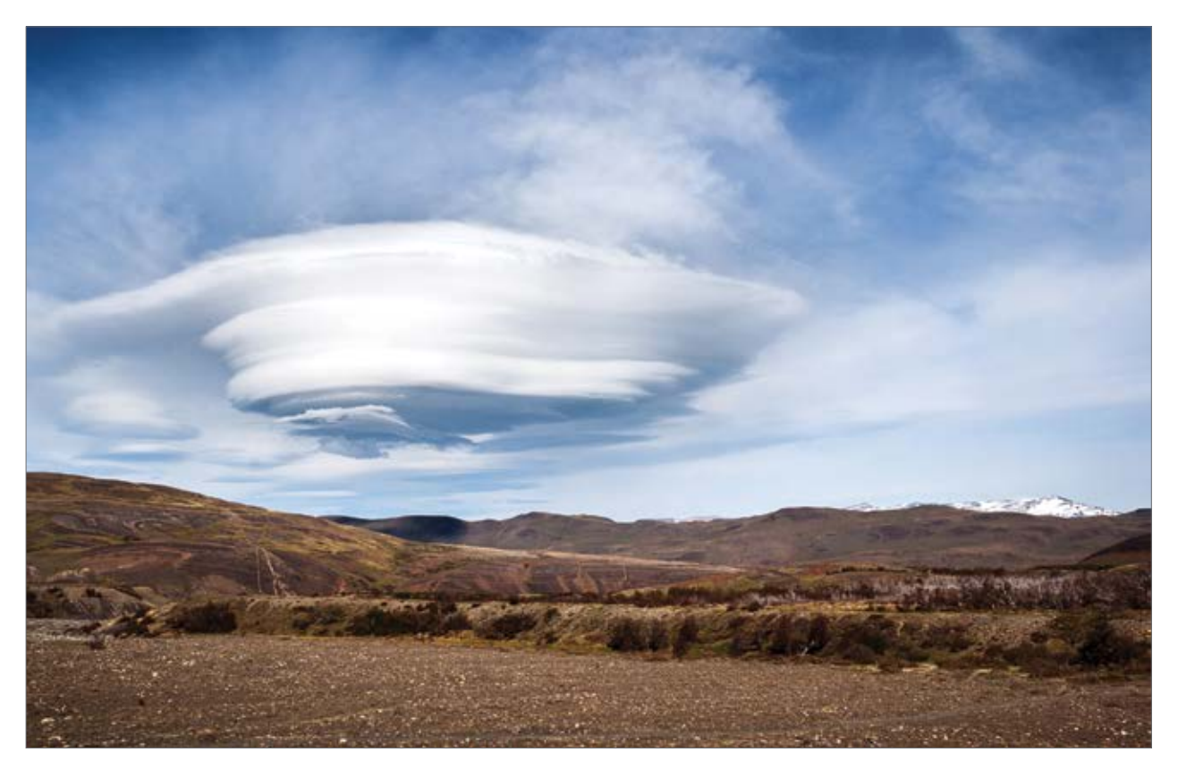
This photograph shows a large lenticular cloud hovering over part of Torres del Paine National Park, in Chile's Patagonia region. Also called UFO clouds or cap clouds, lenticular clouds make it possible to get a rare glimpse at the crests of gravity waves. When air rushes over mountains and the conditions are right, with cold air and water vapor condensing into droplets, lenticular clouds form at the crest of the waves.

Yet amazing things happen in the stratosphere every day—things we cannot see, like massive, invisible waves. These atmospheric phenomena, called gravity waves, have piqued the interest of Corwin Wright, a researcher at the University