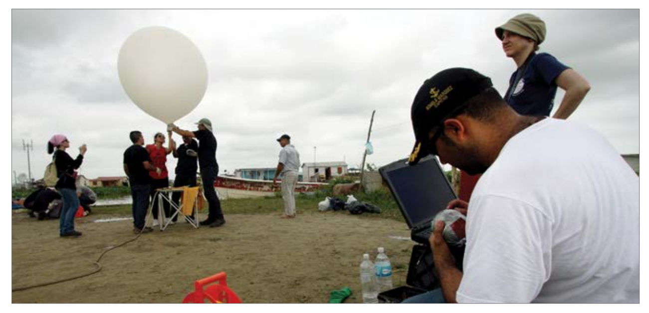
The team works to deploy a weather balloon with sensors attached to measure temperature, relative humidity, and pressure.

All thunderstorms follow a formula: rapidly rising warm air collides with moist air. Unstable air and moisture are key, and Catatumbo Lightning gets a boost from a unique topography. Mountain ridges cup three sides of Lake Maracaibo, leaving a narrow window open north to the Gulf