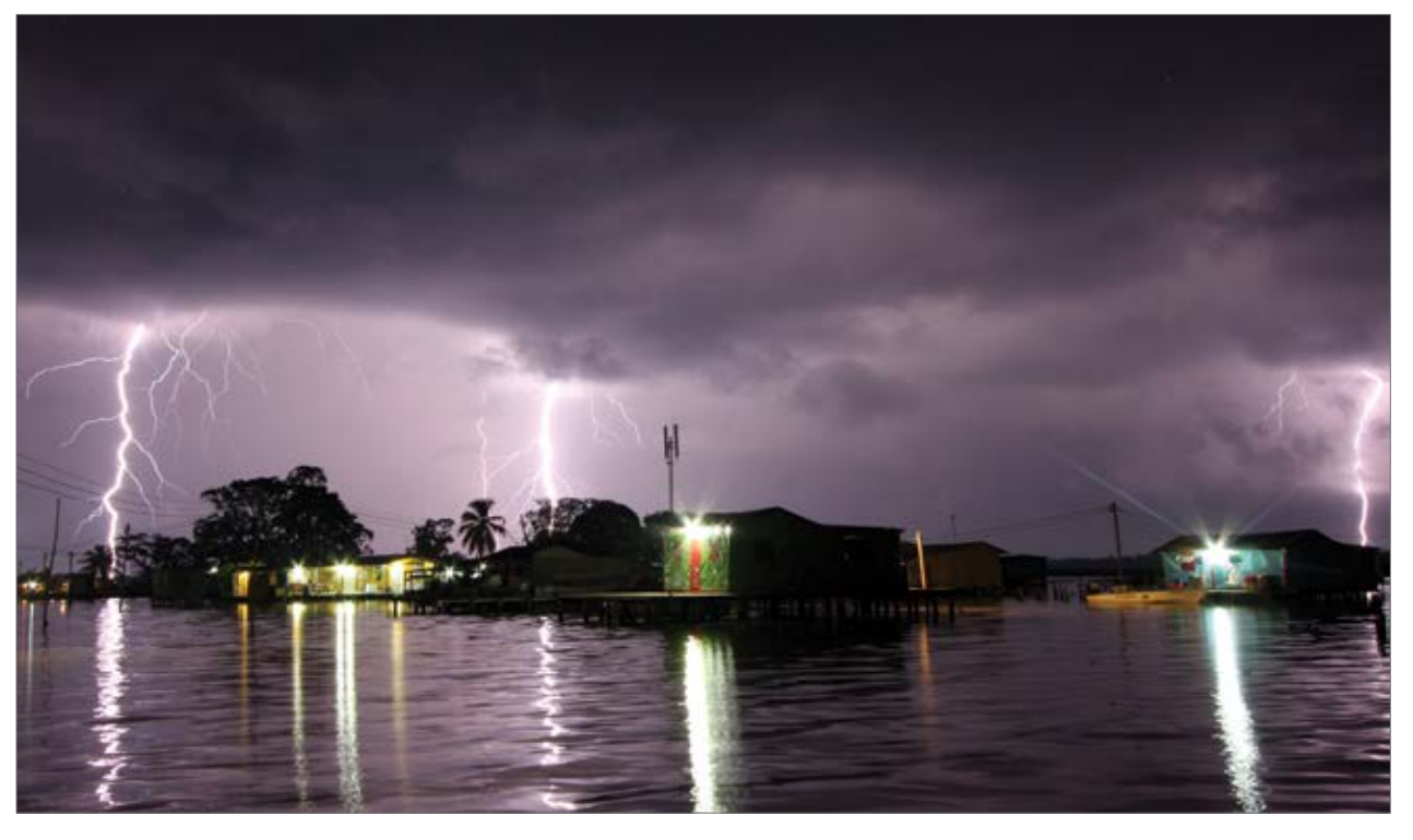
Seen from the shore of Lake Maracaibo, lightning strikes Congo Mirador, a palafito or a stilt house village, near the mouth of the Catatumbo River.